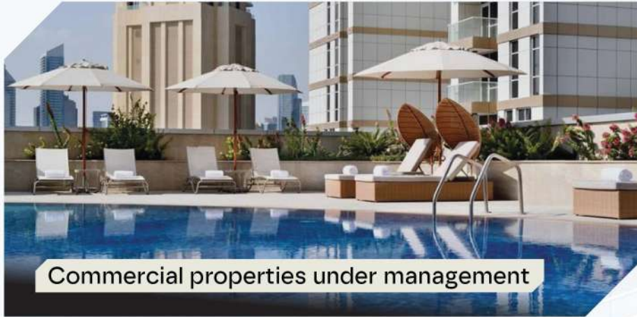
Commercial properties under management