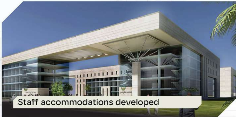
Staff accommodations developed