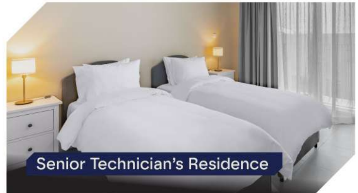
Senior Technician's Residence