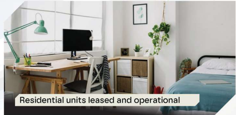
Residential units leased and operational