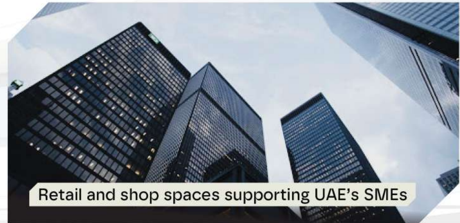
Retail and shop spaces supporting UAE's SMEs